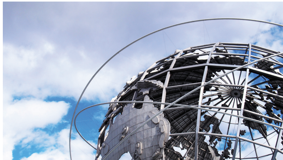
'THE EU has been and is at the avant-garde of globalization. It has been an open trading block largely thanks to elimination of man-made barriers to movement of goods and services...' (Pictured: World's Fair Grounds)

GIVEN THE opportunity, most people prefer to be citizens of a supranational