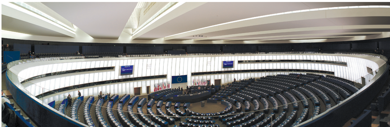
'PARTIES THAT are both Eurosceptic and anti-immigration made strong inroads and are expected to do well in the May 19 elections for the European Parliament (pictured).'

ropeanized. Indeed, just like the Jews since their earliest history, European Muslims chose to maintain their language, dress and names.