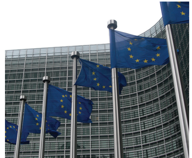
FLAGS WAVE in front of the European Commission building in Brussels.

ulating unprecedented special labels as a condition for sales in Europe. This, the EU claims, is done to “help Palestinians.” Yet denying Palestinians employment, livelihood, mentorship opportunities and professional growth is no help – it is a profound expression of European supremacism and colonialism. On the other hand, members of 11 Eurosceptic parties have established the Friends of Judea and Samaria in the European Parliament to counter the EU boycott.