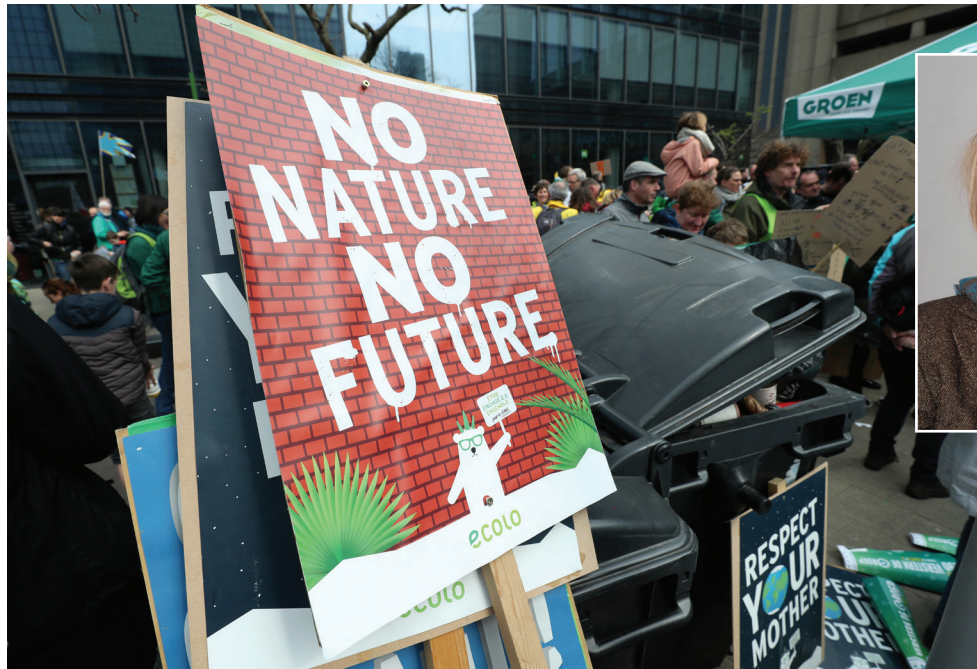
PLACARDS ARE pictured during the ‘Rise for Climate’ demonstration in Brussels on March 31.

In this respect, we stepped up the development of joint military capabilities.