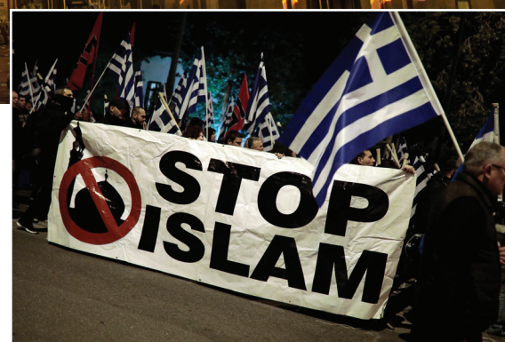
SUPPORTERS OF Greece's far-Right Golden Dawn party hold a banner during a protest against Turkey, in Athens on March 5.

The writer served under various US presidents including Lyndon B. Johnson, Jimmy Carter, Bill Clinton and Barack Obama. Most recently, he was the Obama administration's special adviser to secretaries of state Hillary Clinton and John Kerry on Holocaust-era issues. The author of several books including Imperfect Justice, Future of the Jews and President Carter: The White House Years, he is the recipient of nine honorary degrees and awards from the governments of France (Legion of Honor), Germany, Austria, Belgium, the US and Israel. seizenstat@cov.com.