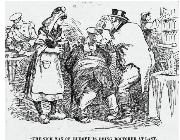
SICK MAN of Europe: Political cartoon by JM Staniforth, 1898. National representations of the Great Powers of Europe ‘healing’ a subdued Crete, dressed in Turkish garb – the ruling power on the island at the time – in the aftermath of the Cretan Uprising in 1898.

‘THE LOSS of London has come just at a time when the continent is caught in a maelstrom of centrifugal forces.’