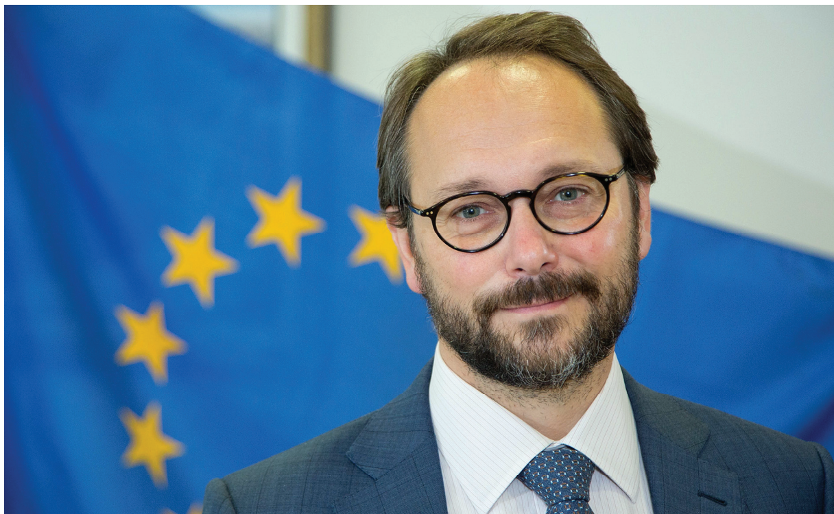
EU AMBASSADOR to Israel Emanuele Giaufret.

A key example is the development of gas fields in the eastern Mediterranean, which places the EU-Israel relationship at a crossroads and is about to add a whole new strategic dimension to our cooperation. As recently expressed by Energy Minister Steinitz himself, Europe is the natural market for eastern Mediterranean gas. And the EU and Israel understand that our challenges are increasingly common, whether on climate change,