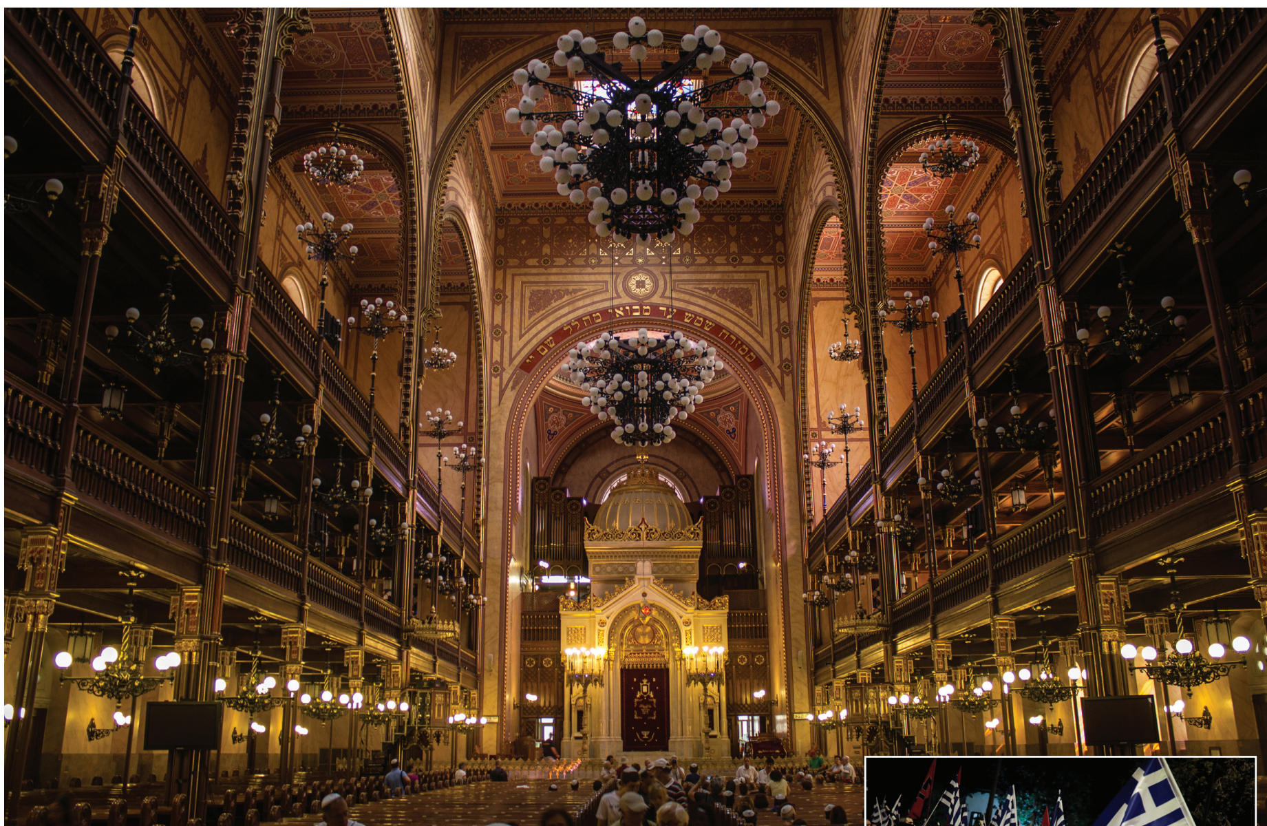
BUDAPEST'S GREAT Synagogue: In Europe, 'I could always tell where the synagogues and Jewish schools were located because they were protected by concrete barriers and heavily armed police.'

10% viewed Jews unfavorably, roughly a third believed traditional antisemitic stereotypes that Jews have too much influence in government and finance; that Israel uses the Holocaust to justify its rule over the Palestinians, and accusations of antisemitism to block criticism of its policies. However, more than two-thirds of those surveyed supported commemoration of the Holocaust to help ensure genocide was not repeated.