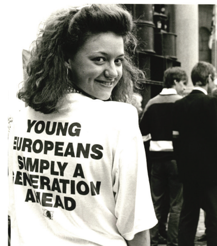
A PROTESTER in Brussels during the European Council, 1987.

The political backlash is the emergence of Europopulism and the rise of extreme parties – both right- and left-wing. A common feature to all is hostility to neoliberal and cosmopolitan elites. This translates frequently into classic nationalism, protectionism, hostility to migrants and foreigners in general, but also to well-integrated minorities, such as European Jews.