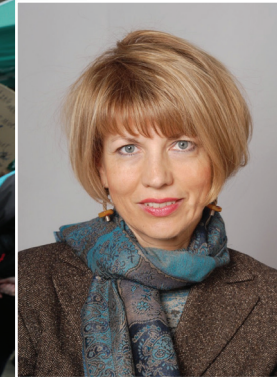
HELGA SCHMID, secretary-general of the European External Action Service.

Through our Permanent Structured Cooperation (PESCO), we will increase joint investments through the European Defense Fund. We are streamlining military command structures (MPCC) and we agreed on